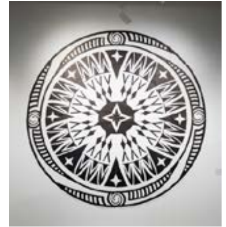
Oklahoma Blossom , 2025