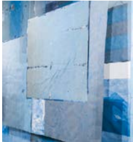
No Mother Tongue (detail), 2019-2025