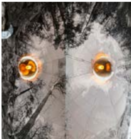
Quadraphonic Spring (detail), 2025