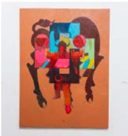
The Bonds of Antiquity: Millimillenary , 2025