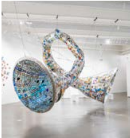
Loop: Gravity Repeated , 2025