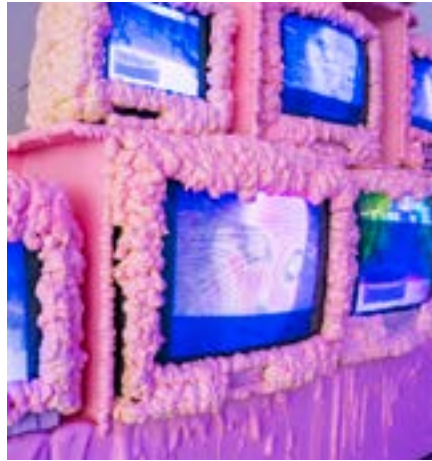
stepmom TV Wall (detail), 2024