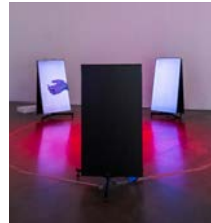
There is no movement without rhythm (detail), 2021