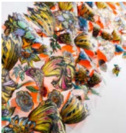
Tulipmania (detail), 2019-2025