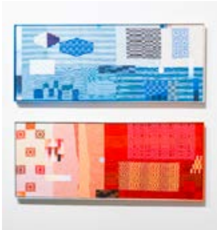
Reminder (top), 2025 and Rewinder (bottom), 2025