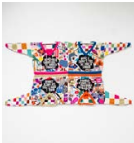
I Remember Thinking It Would Change , 2024