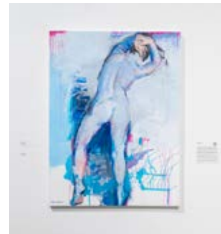
Warm Hands , 2025

Andy Mattern is a visual artist working in the expanded field of photography. His photographs and installations dissect the medium itself, reconfiguring expectations of photography's basic ingredients and conventions. His work is held in the permanent collections of the San Francisco Museum of Modern Art, the New Mexico Museum of Art, and the Museum of Fine Arts, Houston, among others. His photographs and exhibitions have been reviewed in publications such as Artforum , The New Yorker , Camera Austria , and Photonews . He holds an MFA in Photography from the University of Minnesota and a BFA in Studio Art from the University of New Mexico.