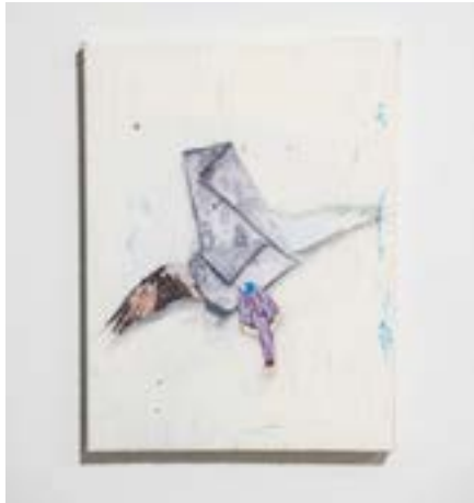
Angelus Novus in Black and White with Two Wings and Tail , 2025