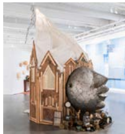
I give to you a piece of me , 2025