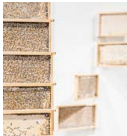
Beehive States (detail), 2024