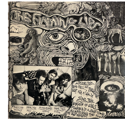
▲ Wayne Coyne, Flaming Lips EP (back cover), 1984.