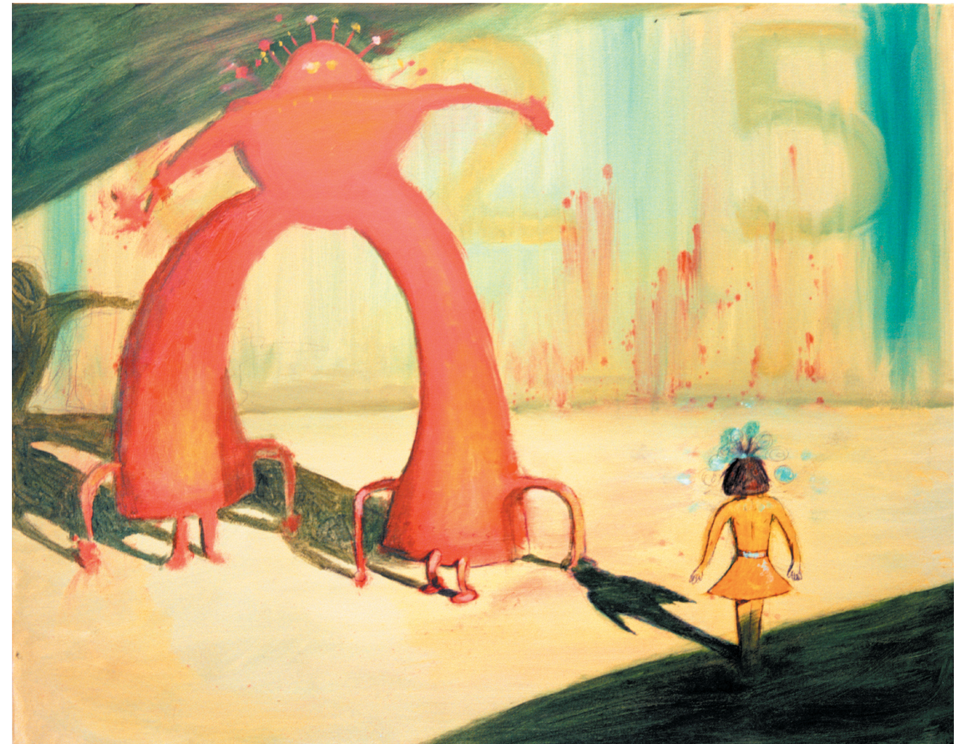
▲ Wayne Coyne, Yoshimi Battles the Pink Robots (album cover painting, front), 2000.

Original artworks and collaborations sit in dialogue with sound-based projects such as Zaireeka and 7 Skies H3 , as well as film works and selections from the Yoshimi Battles the Pink Robots graphic novel project. Together, these elements create an experience that invites audiences to move through, listen to, and actively engage with Coyne's interconnected artistic universe.