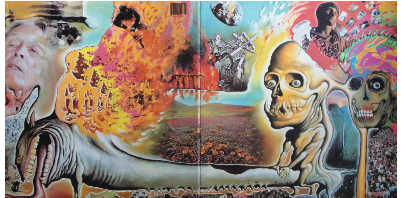
▲ Wayne Coyne, Oh My Gawd!!! (album collage), 1987.